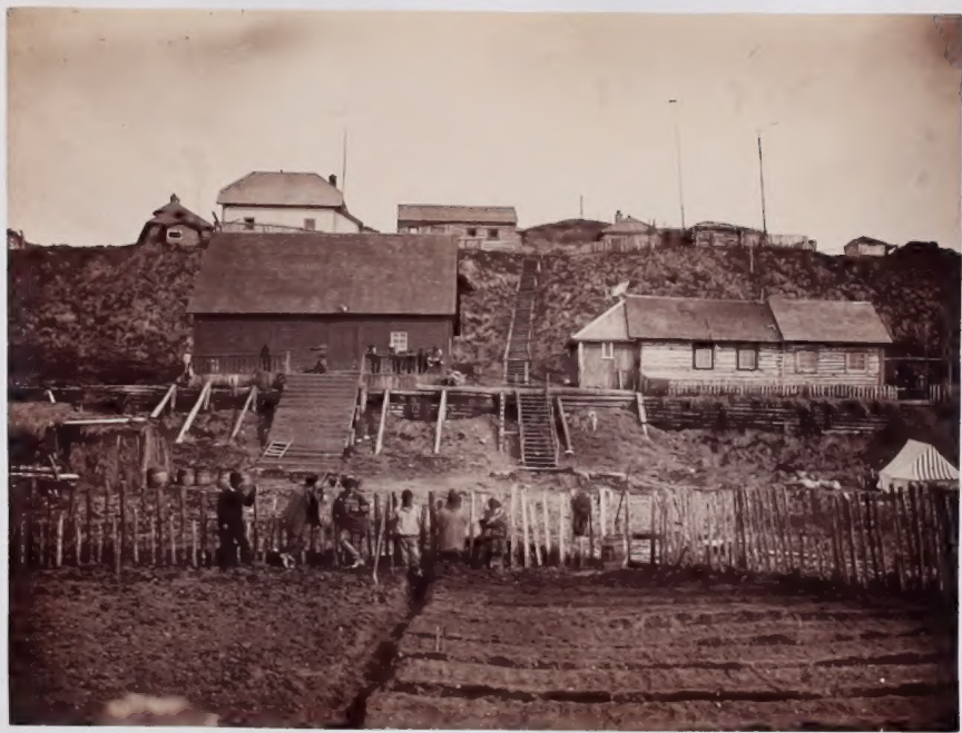
10. Nushagak—Lower part.